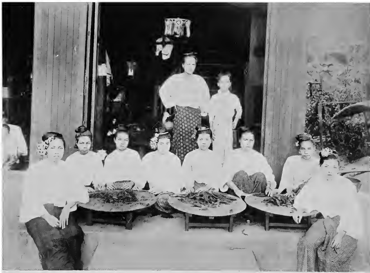
Group of Burmese Cigar Makers